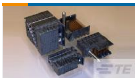
TE Part # 2007703-1 IMP100S,R,RA3P10C,LG,39