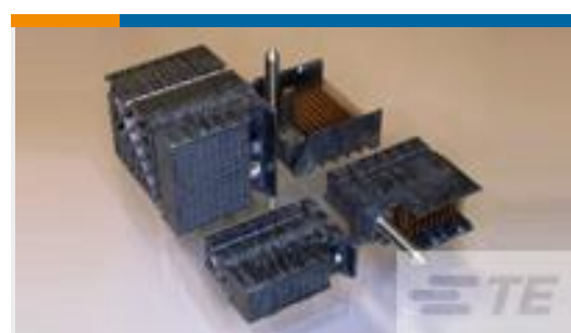
TE Part # 2007705-1 IMP100S,R,RA3P10C,UG,39