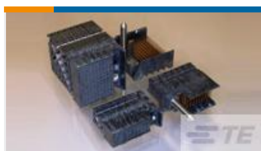
TE Part # 2007702-1 IMP100S,R,RA3P10C,UG,46