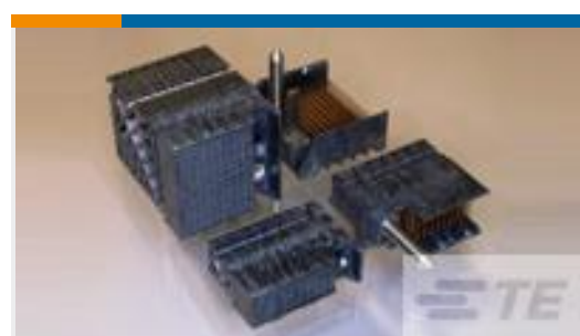
TE Part # 2007701-1 IMP100S,R,RA3P10C,RG,46