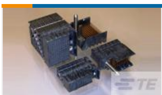
TE Part # 2007700-1 IMP100S,R,RA3P10C,LG,46