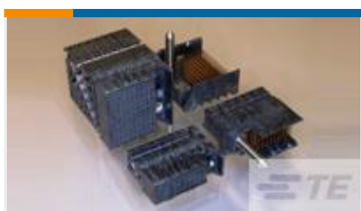
TE Part # 2007704-1 IMP100S,R,RA3P10C,RG,39